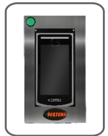
SS Panel for Protection