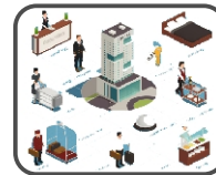
Amenity Booking Management