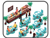
Canteen Token Management