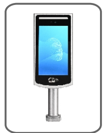
Turnstile Mounting Stand