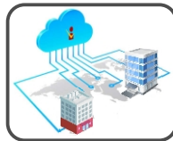
Cloud based Attendance