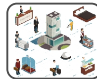
Amenity Booking Management