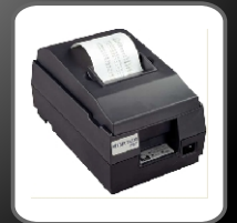
Printer for Canteen