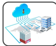
Cloud based Attendance