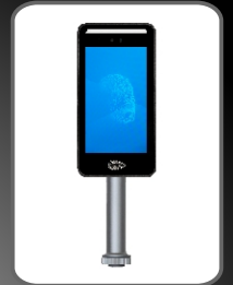
Turnstile Mounting Stand