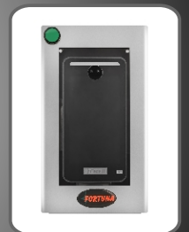
SS Panel for Protection