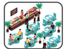
Canteen Token Management