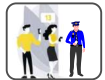
Attendance for Hostel, Security Guard