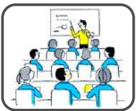
Attendance at Class rooms, Examination Halls