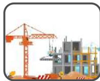
Attendance at Construction sites