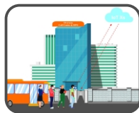
Multi-door Call Centre with Global Anti-pass Back