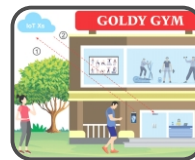
Gyms In Multiple Locations