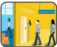
Office Access Control