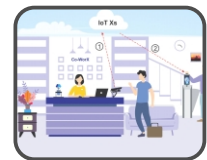
Co-working & Co-living Spaces