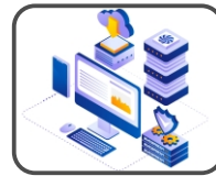
Time and Attendance for employees - On Prem and Cloud