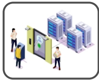
Access Control at large complexes