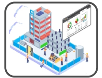
Access Control at Industries and Construction sites